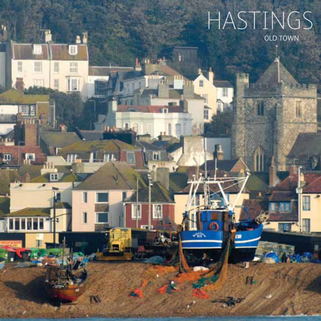
HASTINGS OLD TOWN